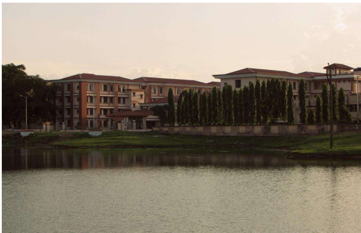
(View of Hostels)