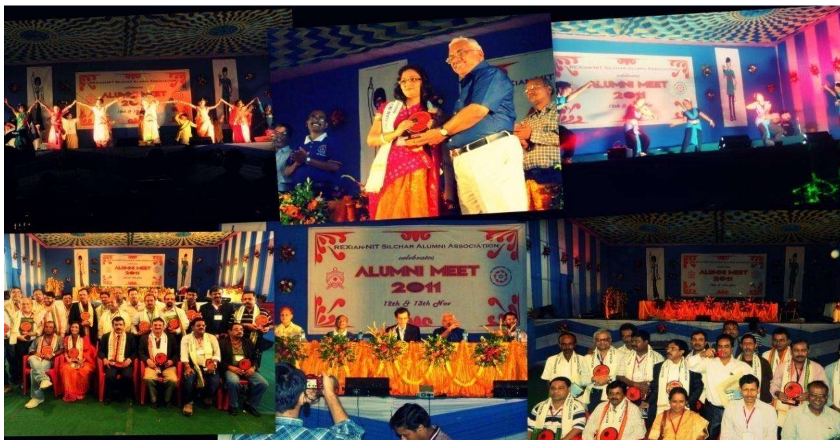
(Glimpses of Alumni Meet)