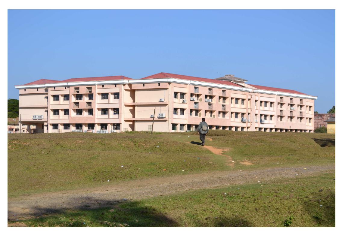
Campus Photograph 3