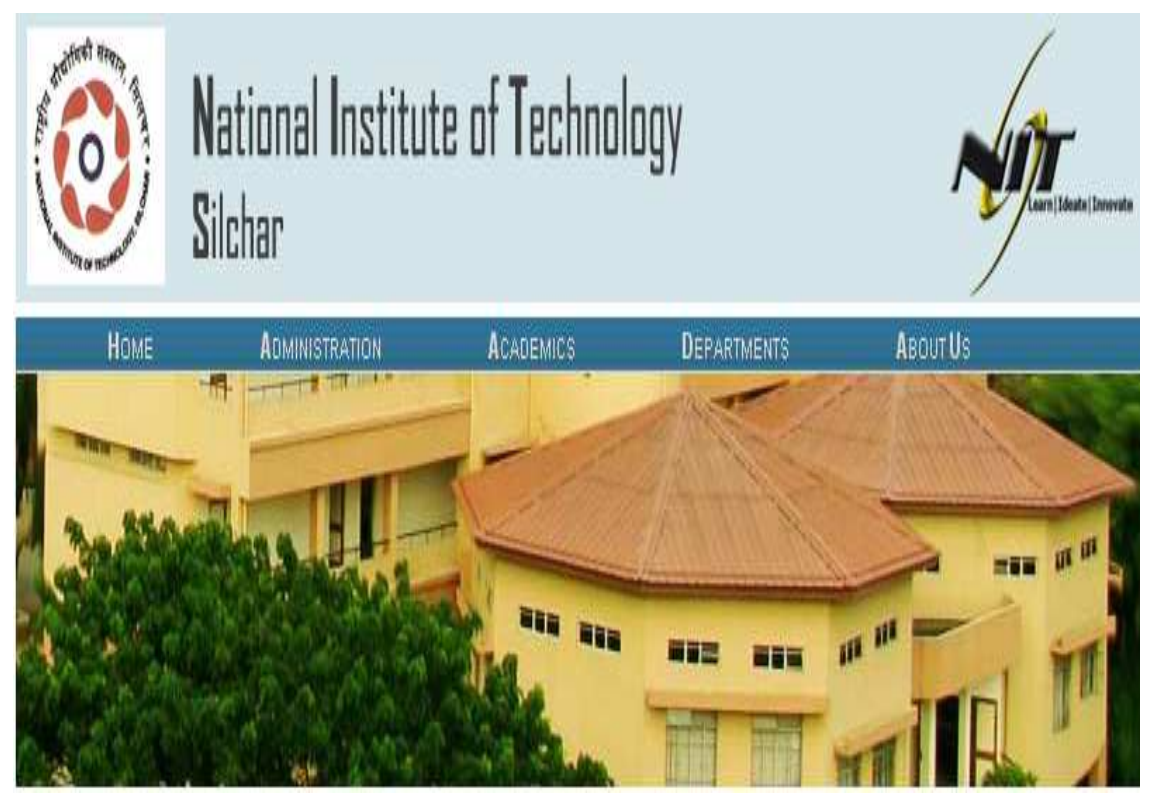
Campus Photograph 1

Functionally and aesthetically spread out, the campus aims at intellectual growth in an ambience that is free-flowing and community-friendly. The soothing breeze rustling through the naturally gifted lustrous greenery and bluish lakes is just one of the several ingredients that create an amazing atmosphere; just the right conditions essential to concentrate on studies.