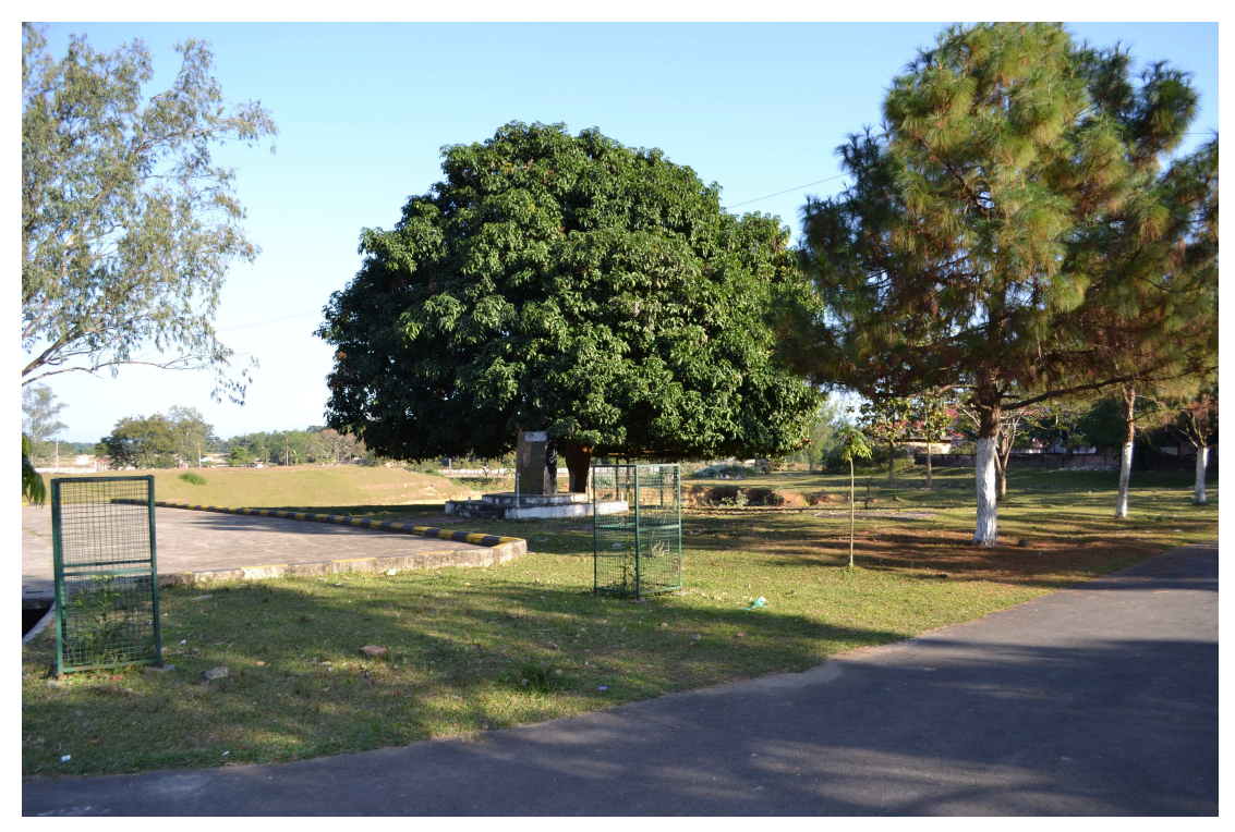
Campus Photograph 2